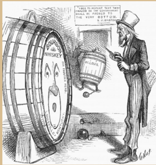
Harper's Weekly, March 1876

The best grades of whiskey, aged in oak barrels, originated in Scotland and Kentucky and sold for twice the cost of more ordinary fare. But even this was often blended or "rectified," and the work of rectifiers was taken for granted. A tongue-in-cheek account of such tampering was reported in the Jacksonville Sentinel in the early 1860s under the title "Rot Gut." It explained that "in