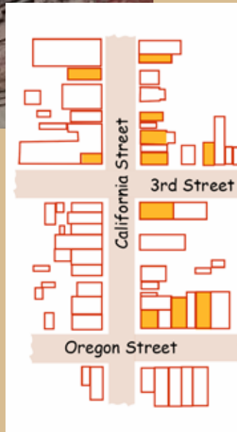
The Table Rock Billiard Saloon, shown at upper left, dates to 1860 and is among the oldest surviving structures of early Jacksonville. Map shows distribution of Jacksonville saloons in 1883.

One of Jacksonville's oldest existing commercial structures, dating from 1860, was a saloon. In the early 1880s Jacksonville was still a wide-open town, with no less than eleven saloons and a brewery still in operation—twice the number of drinking houses as comparably sized rival Ashland. But times were changing. By 1898, only the brewery and four other drinking establishments, including the Marble Corner and the Table Rock, appear on Sanborn maps. By 1910 the brewery had closed, but the saloons held on. However, with the coming of Prohibition ten years later, all public sales of alcoholic drinks ended.